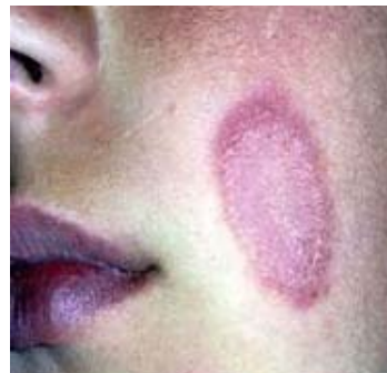
Tinea Corporis