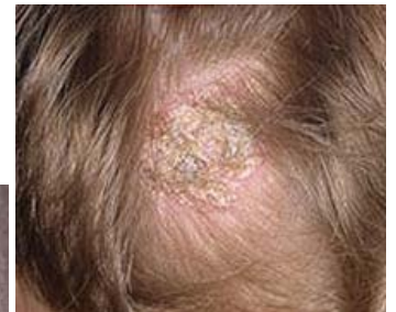
Tinea Capitis